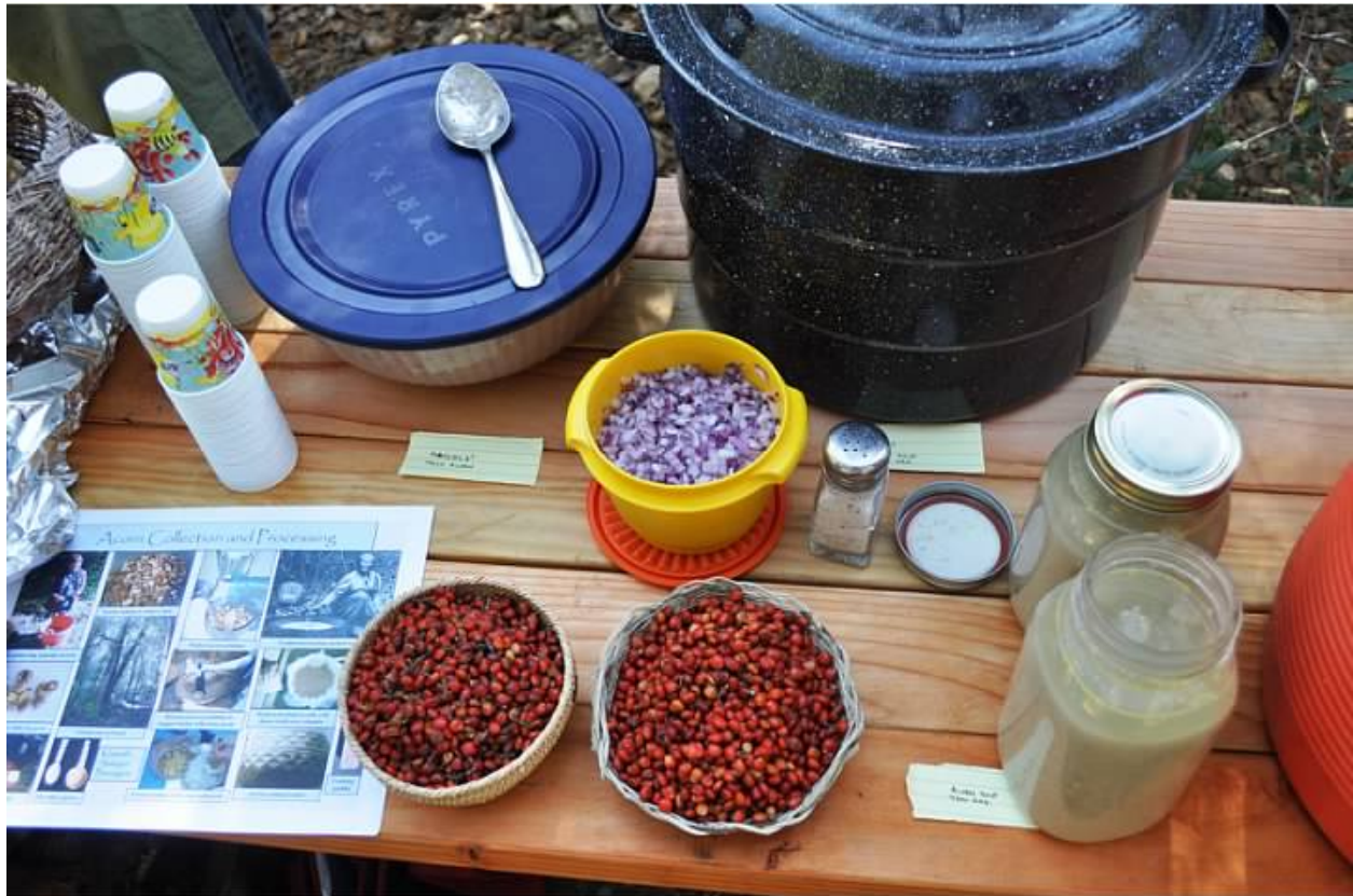
Figure 2: Traditional forest products, including sourberries and soup from black oak acorns, harvested for a native foods feast at the California Indian Conference, October 2011.

since many Sierra Nevada tribes have similar or related cultural, language, and basketry traditions (Anderson 2006a, Jordan and Shennan 2003).