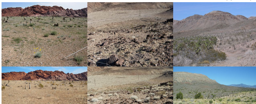
Fig 1: Left and middle columns: example burned plots in 2007 (top) and 2019 (bottom; photos by S.R. Abella). Right column: burned-unburned contrasts on two fires (photos by E.C. Engel).

Perennial species richness on average was fully resilient within 23 years after fire in both community types. Perennial cover was fully resilient within 25 years in the creosote community, but recovery was projected to require 52 years in the blackbrush community. Species composition shifts were persistent, and in the blackbrush community, the projected compositional recovery time of 550 years and increasing resembled a deflected trajectory toward potential