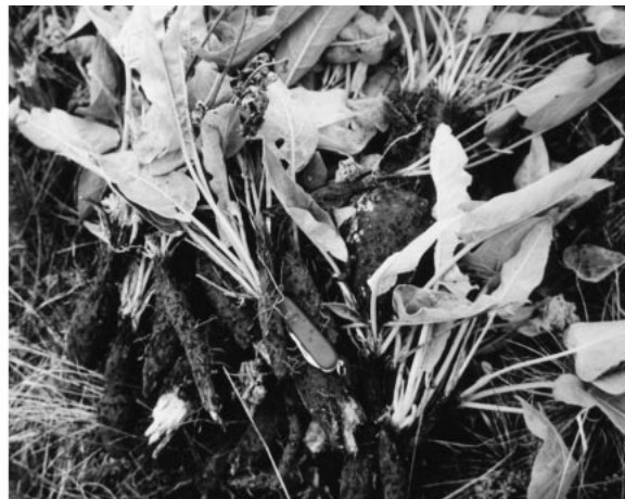
FIG. 3. Left: Balsamroot or spring sunflower, Balsamorhiza sagittata (Asteraceae). Right: Harvested roots of B. sagittata , to be peeled and pit-cooked before being eaten.

grain or other food for the rodents in return for their “gift.”