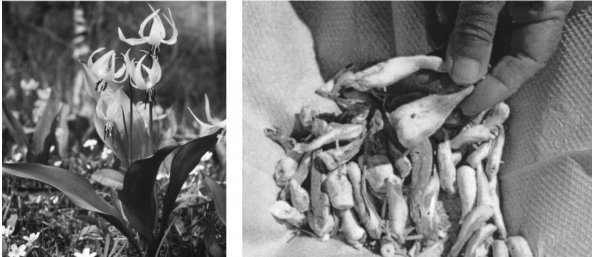
FIG. 2. Left: Yellow avalanche lily, or yellow glacier lily, Erythronium grandiflorum (Liliaceae). Right: Dried bulbs of E. grandiflorum .

She also noted that people would leave the dug-over locality alone for three or four years after an intensive harvest, moving to another location in the interim. After this time, the younger bulbs would have matured and would be ready for further harvest. The continuous digging and tilling of the soil, weeding, and breaking up and spreading of clumped bulbs evidently optimized the productivity of the lilies, for the preferred harvesting grounds are those that traditionally have been dug intensively.