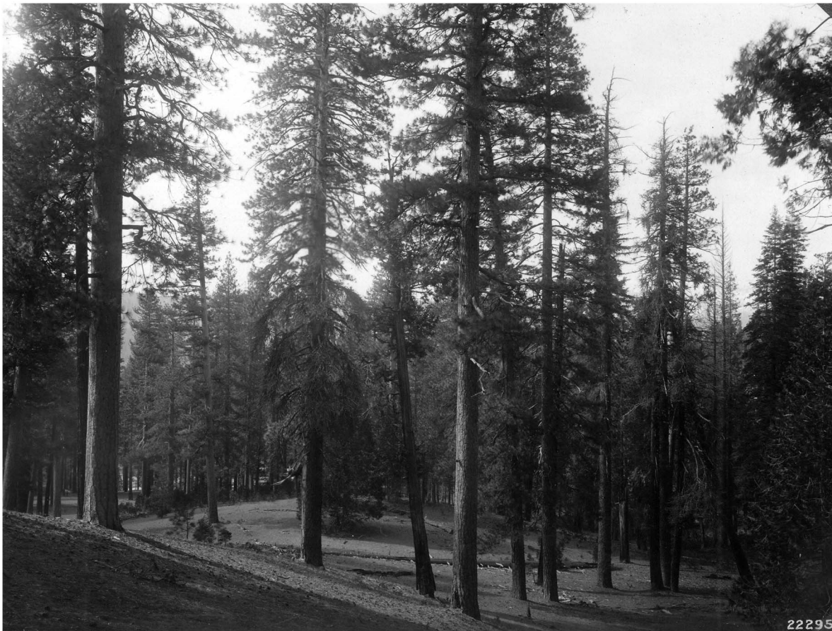
Fig. 1. Mixed conifer forest from Chiquito Basin on the Sierra National Forest. Photo taken in 1914 by E. G. Dudley (USFS Bass Lake Ranger District historic photo archives; photo no. HP00971). Original caption read, “Typed-Sugar Pine killed by Dendroctonus monticolae , Chiquito Basin. Taken by Dudley, 1914.”

of time between the reconstruction period and data collection, as there is with most historical forest reconstructions in the western US (>100 years), uncertainty increases owing to sample losses from fire, insects, disease, and decomposition (Collins et al. 2011).