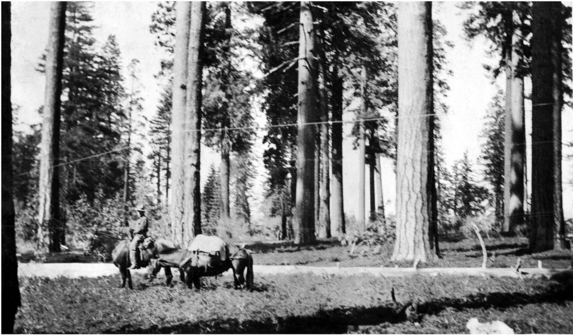
Fig. 2. Historic conditions in a ponderosa pine stand on the Sierra National Forest (ca. 1917).