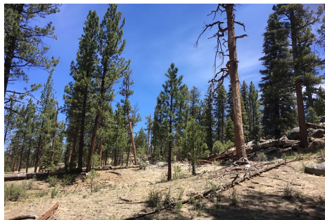
Figure 1: Jeffrey pine stand in the SSPM.