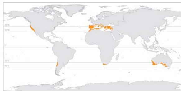
Figure 1 Global occurrence of Mediterranean-type ecosystems: southwestern Australia, the Cape Region, Mediterranean Basin, California, and central Chile.

There are many other important differences among the five MTE biomes. For instance, CA and Chile have the longest, driest summers with the greatest interannual variation in precipitation. The Cape and SWA have the least interannual variation, with small but significant amounts of winter rain, while the MB is intermediate in winter precipitation among the five MTEs. More detailed descriptions of the specific pressures causing both species diversification and convergence in each MTE is included in the paper, along with a beautiful set of representative photos for each biome (e.g., see Fig.6).