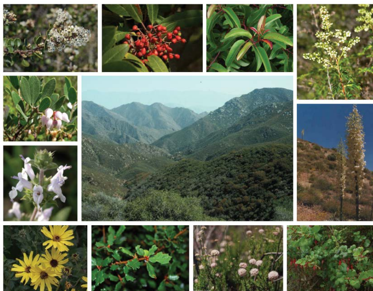
Figure 6 California. Centerpiece, chaparral in the San Gabriel Mountains of southern California. From upper left clockwise: Comotus megacarpus (Rhamnaceae), Heteromeles arbutifolia (Rosaceae), Malosma laurina (Anacardiaceae), Adenostoma fasciculatum (Rosaceae), Hesperoyucca whipplei (Asparagaceae), Ribes speciosum (Grossulariaceae), Eriogonum fasciculatum (Polygonaceae), Quercus berberidifolia (Fagaceae), Encelia californica (Asteraceae), Salvia mellifera (Lamiaceae), and Arcostaphylos bookeri (Ericaceae).