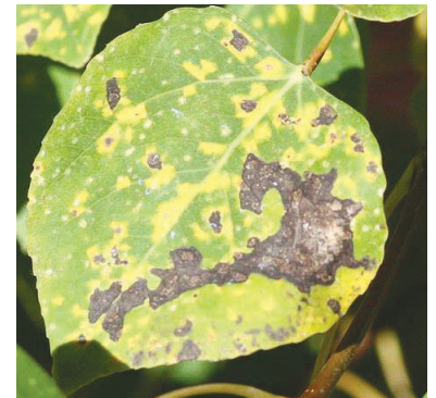
Figure 3. Yellow and necrotic spots on the upper surface of infected aspen leaves.