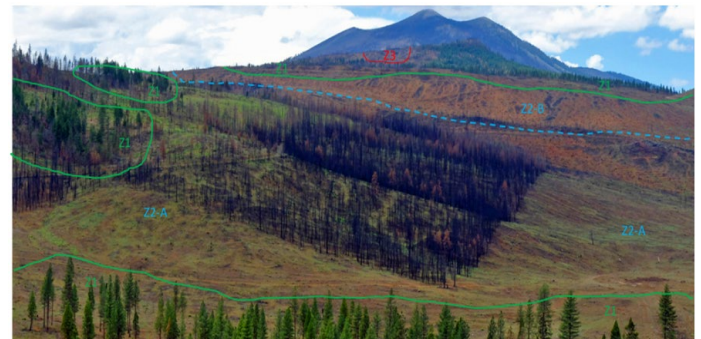
Fig 2. A partially salvaged area two years after the 2014 Eiler Fire near Burney, California. Zone 1, outlined in green, indicates areas likely to receive seed from adjacent islands of green trees. Zone 2, in the remaining area beyond most natural recruitment, are the areas readily accessible for reforestation. Two areas within this zone, A and B separated by the blue dashed line, indicate gentler, more uniform topography (A) and more variable, steeper sloped conditions (B), each of which could have a different planting strategy discussed in the text. The unsalvaged, snag area in the center could be planted if safety allows (facilitating future forest habitat connectivity) or left to provide wildlife habitat for post-fire specialists. Zone 3, outlined in red in the distant center of the photo, is a steep slope, distant from access roads that might be planted with founder stands (groups of seedlings in mesic, sheltered microsites less likely to burn or become drought stressed).

When follow-up treatment is needed, greater use of low-intensity prescribed burns is proposed. While such burns produce more variable results than traditional mechanical treatments, they are also less costly and contribute to the type of spatial heterogeneity that fosters long-term resilience. That said, the authors recognize the need for more research on the effects of prescribed fire on regeneration, as well as improved understanding of the physiological responses of seedlings to a variable planting approach.