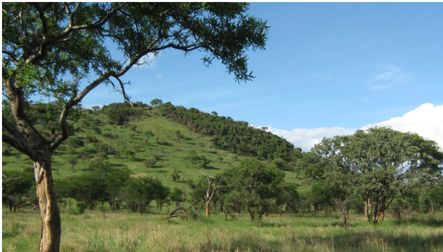
FIGURE 1 Forest-savanna mosaic under the same geology in the Serengeti, home to one of the world's richest remaining open habitat megafaunas. Savanna fires have killed some of the trees at the edge of the forests, and elephants have killed some of the trees in the savanna. The Serengeti is mapped as “deforested” and “degraded” in the Atlas of Forest Landscape Restoration Opportunities of the World Resources Institute ( www.wri.org/applications/maps/flr-atlas/ ; see forest condition). The Atlas is used as a basis for global forest landscape “restoration” projects. This suggests persistent misunderstanding of ecosystem dynamics and the long-lasting legacy of Humboldt. [Colour figure can be viewed at wileyonlinelibrary.com ]

In Man and Nature , Marsh (1865), an early conservationist, mentioned that “Humboldt was a great apostle.” While Marsh rightly criticized anthropogenic deforestation, he also contributed to creating a romantic forest-centred culture of nature that fuelled the conservation movement. Man and Nature had a narrow view of nature; no single chapter was dedicated to any biome other than forest, despite the considerable terrestrial biodiversity found outside forests. Following this line, the 1873 Timber Culture Act in the US, which was inspired by Man and Nature (Wulf, 2015), encouraged planting trees on grasslands and prairies regardless of whether they were ancient old-growth systems with a long history of fires and large herbivores (Edwards, Osborne, Strömberg, & Smith, 2010; MacFadden, 2005; Veldman et al., 2015). Even today, global “forest restoration” programs are threatening many species-rich savannas and grasslands (Bond, 2016; Figure 1).