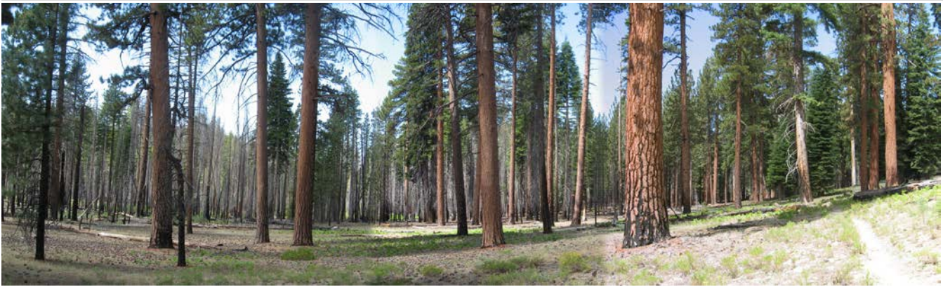
Fire is an important ecological process that can exhibit self-limiting characteristics across an entire landscape, such as the Illilouette Basin of Yosemite National Park.