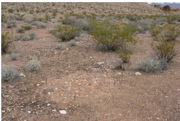
Fig 1. Plot (1 m 2 ) showing persistent reduction in biocrust cover where carbon was added intended to reduce non-native plants, Mojave Desert.

Where herbicide is not allowed or may have undesirable non-target effects, one of the alternative treatments that has been proposed and used in more mesic habitats is carbon addition. The idea behind carbon addition is that adding carbon is an energy source for soil